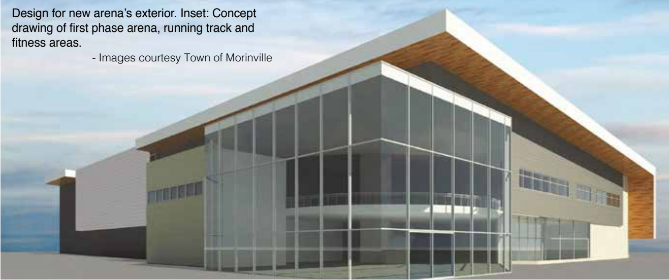
Design for new arena's exterior. Inset: Concept drawing of first phase arena, running track and fitness areas.